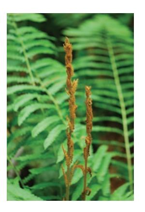
Cinnamon fern (Osmundastrum cinnamomeum)

Please note: Many programs are eligible for continuing education credits for professionals in conservation, horticulture, landscape, and arboriculture. Please check the program listings on the website <u>NativePlantTrust.org</u> for details.