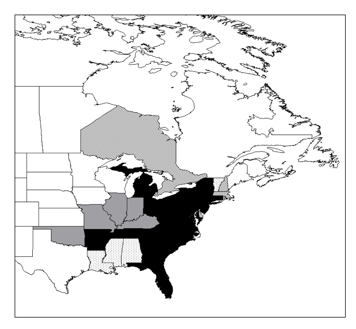
Figure 1. Occurrences of Platanthera ciliaris in North America. States and provinces shaded in gray have one to five current occurrences of the taxon. Areas shaded in black have more than five confirmed occurrences. States and provinces with diagonal hatching are designated "historic" or "presumed extirpated," where the taxon no longer occurs. States with stippling are ranked "SR" (status "reported" but not necessarily verified). See Appendix for explanation of state ranks.