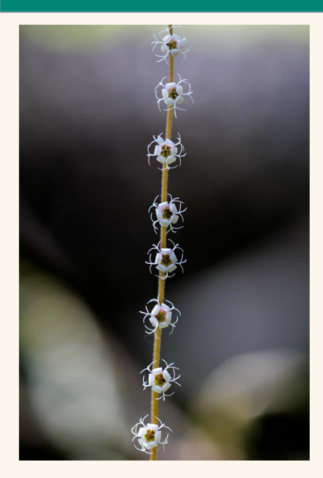
This Blue Mountains member of the Saxifragaceae is Ozomelis stauropetala (side-flowered mitrewort) and is a relative to the New England native Mitella diphylla (two-leaf miterwort) which grows at Garden in the Woods.