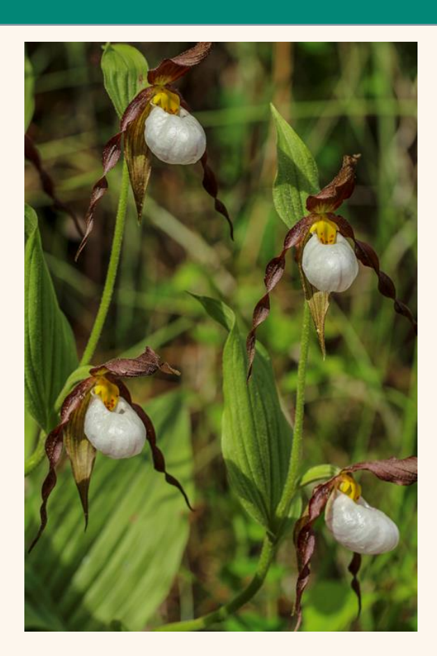
New England has four species of the impressive lady's slipper orchids, but here in the more arid Blue Mountains of southeastern Washington and northeastern Oregon, Cypripedium montanum (mountain lady's slipper) is the most common of two representatives of this genus.