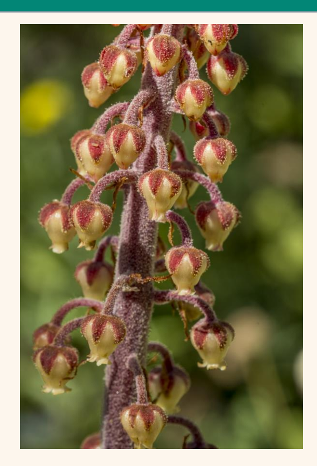
Pterospora andromedea (woodland pinedrops), a member of Ericaceae, is a non-photosynthetic parasite - it obtains nutrients from mycorrhizal fungi that have established symbiotic relationships with the roots of other plants.