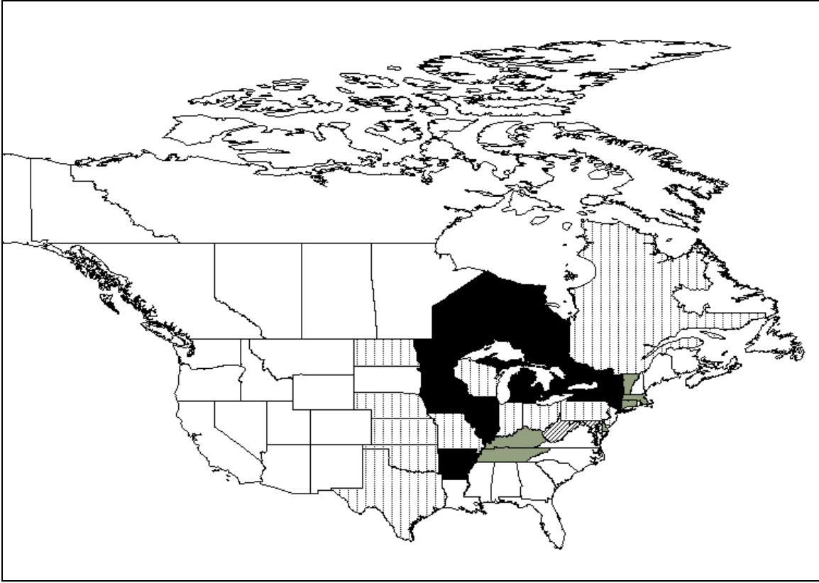
Figure 1. Occurrences of Carex davisii in North America. States and provinces shaded in gray have one to five (or an unspecified number of) current occurrences of the taxon. States shaded in black have more than five confirmed occurrences. The states with diagonal hatching are designated "historic," where the taxon no longer occurs. States with stippling are ranked "SR" (status "reported" but not necessarily verified). See Appendix 2 for explanation of state ranks.