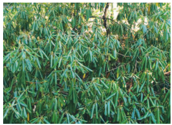
Thirsty Rhododendron maximum in Massachusetts

The likelihood of that happening is unclear. The National Oceanic and Atmospheric Administration forecasts a 50-percent chance of above-average temps for the region during the next 12 months, but precipitation remains a wild card. When rain does fall, groundwater levels will take time to recover, says hydrologist William Coon of the U.S. Geological Survey in Ithaca, N.Y. "Intense rainfall tends to run off dry, hard ground," he says. "And a steady, gentle rain penetrates the surface but has to fill the spaces between soil particles before reaching the water table." •