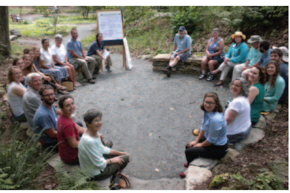
Interns gathered to present their projects at the Curtis Woodland Garden.

interns who presented to their peers and guests at the Society's annual Intern Walk in August, at Garden in the Woods. Each intern presented a project prepared during the season. Invited guests included Contributor, Supporter, Sustainer, and Conservation Circle members, whose personal philanthropy helps underwrite the internships. This summer's projects ranged from creating a new entrance garden at Nasami Farm to collecting seeds to restore coastline damaged by Hurricane Sandy.