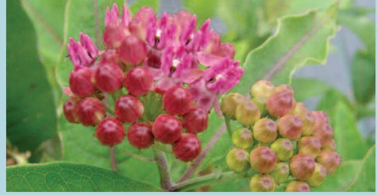
Purple milkweed (Asclepias purpurascens) is endangered in Massachusetts and a species of special concern in Connecticut.

Please donate online at www.newenglandwild.org/support, or contact the Philanthropy Department: 508-877-7630, x3802; gifts@newenglandwild.org.