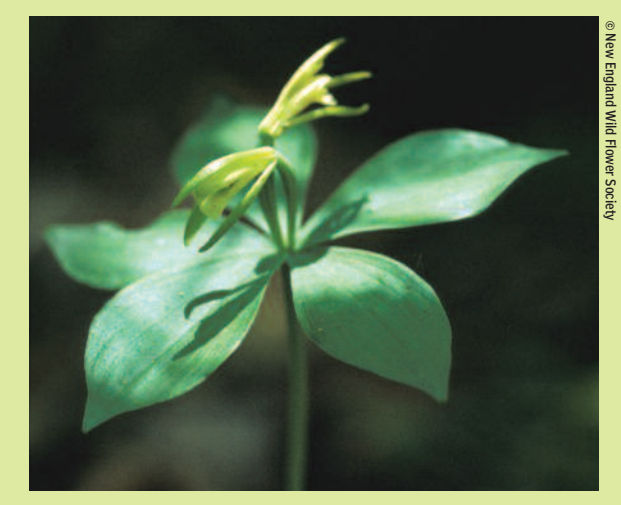
Small whorled pogonia ( Isotria medeoloides ), globally rare and federally endangered, grows only in New England.

* "Species Recovery in the United States: Increasing the Effectiveness of the Endangered Species Act," Evans, et al., Issues in Ecology 20 , Winter 2016.