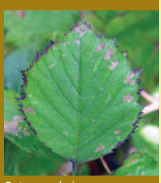
Crataegus oakesiana