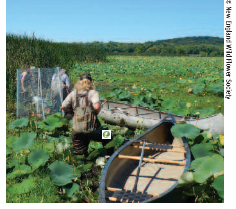
Conservation staff members thrashed through a watery jungle of American lotus ( Nelumbo lutea ) to set up sites for planting wild rice.

Massachusetts: In an ongoing experiment to reintroduce wild rice ( Zizania aquatica ) on the Sudbury River, we set up exclosures at new sites in Great Meadows National Wildlife Refuge. Later this fall, we will return to sow seed in the exclosures, which fence out waterfowl and carp. The U.S. Fish and Wildlife Service contracted with the Society for this restoration. •