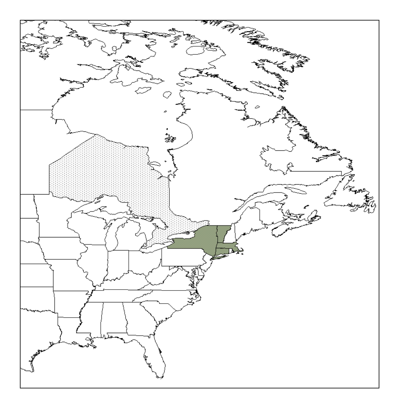
Figure 1. Distribution of Potamogeton ogdenii in North America. States shaded in gray have 1-5 confirmed, current occurrences of taxon. Ontario, stippled, has two occurrences of the taxon confirmed from herbarium records; the current status of those populations is unknown.