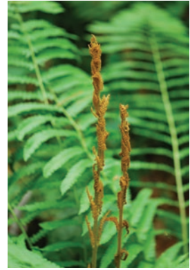
Cinnamon fern ( Osmundastrum cinnamomeum )

Please note: Many programs are eligible for continuing education credits for professionals in conservation, horticulture, landscape, and arboriculture. Please check the program listings on the website NativePlantTrust.org for details.