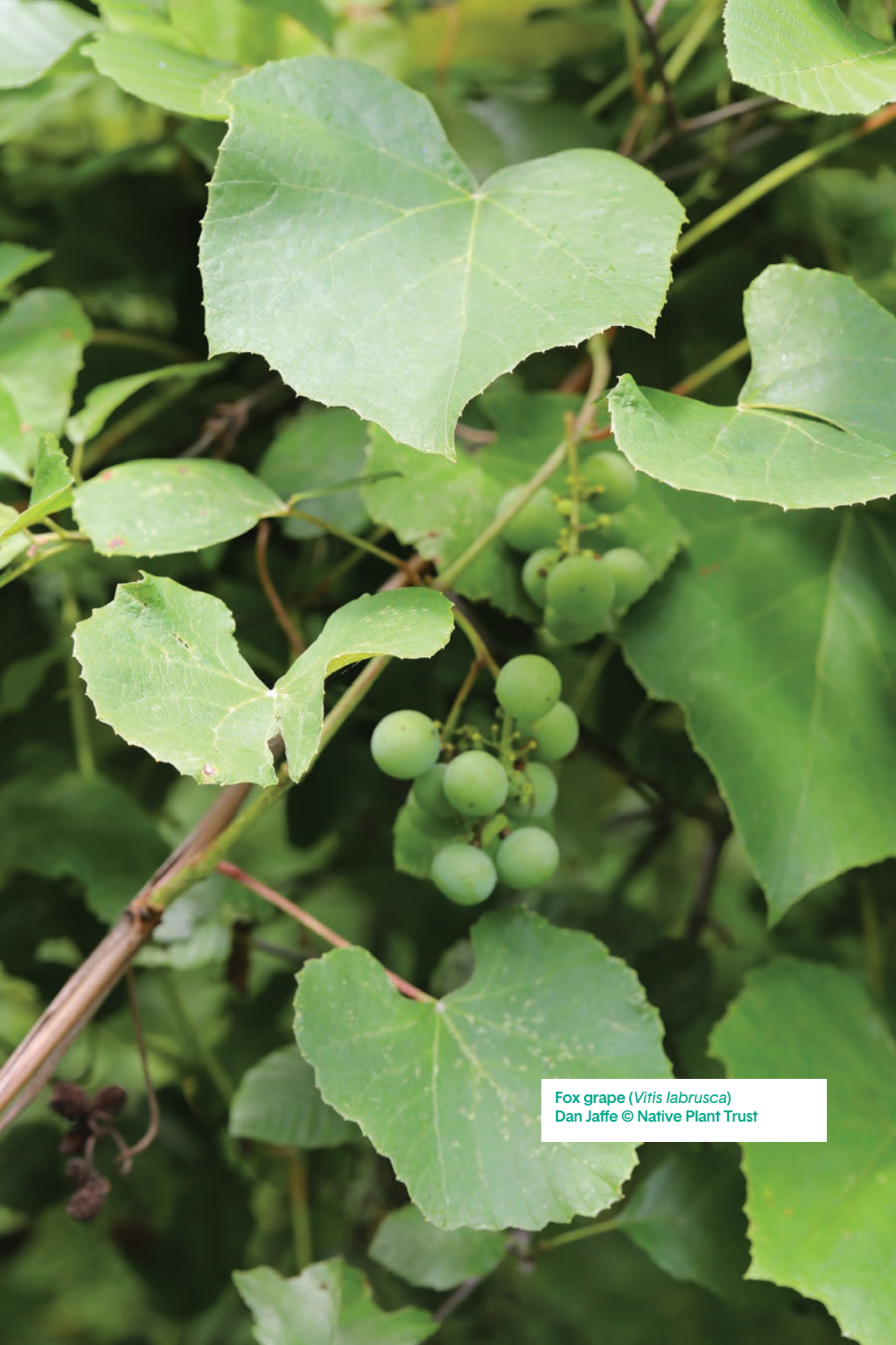
Fox grape ( Vitis labrusca ) Dan Jaffe © Native Plant Trust