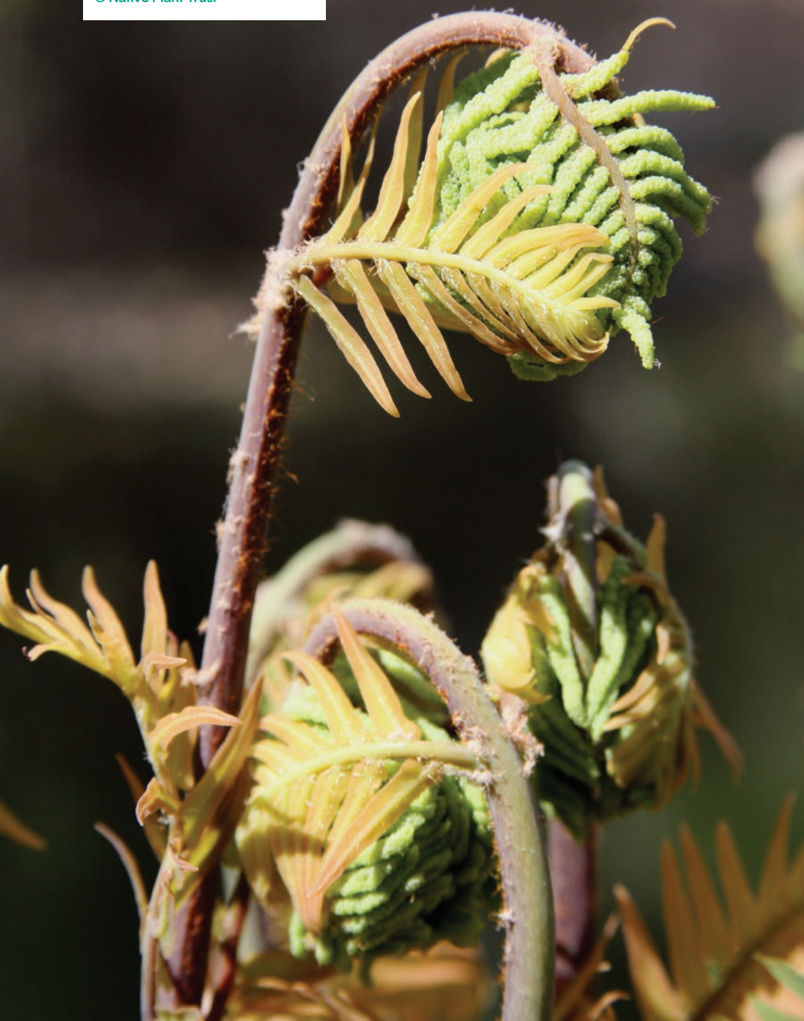
Royal fern ( Osmunda regalis var. spectabilis )