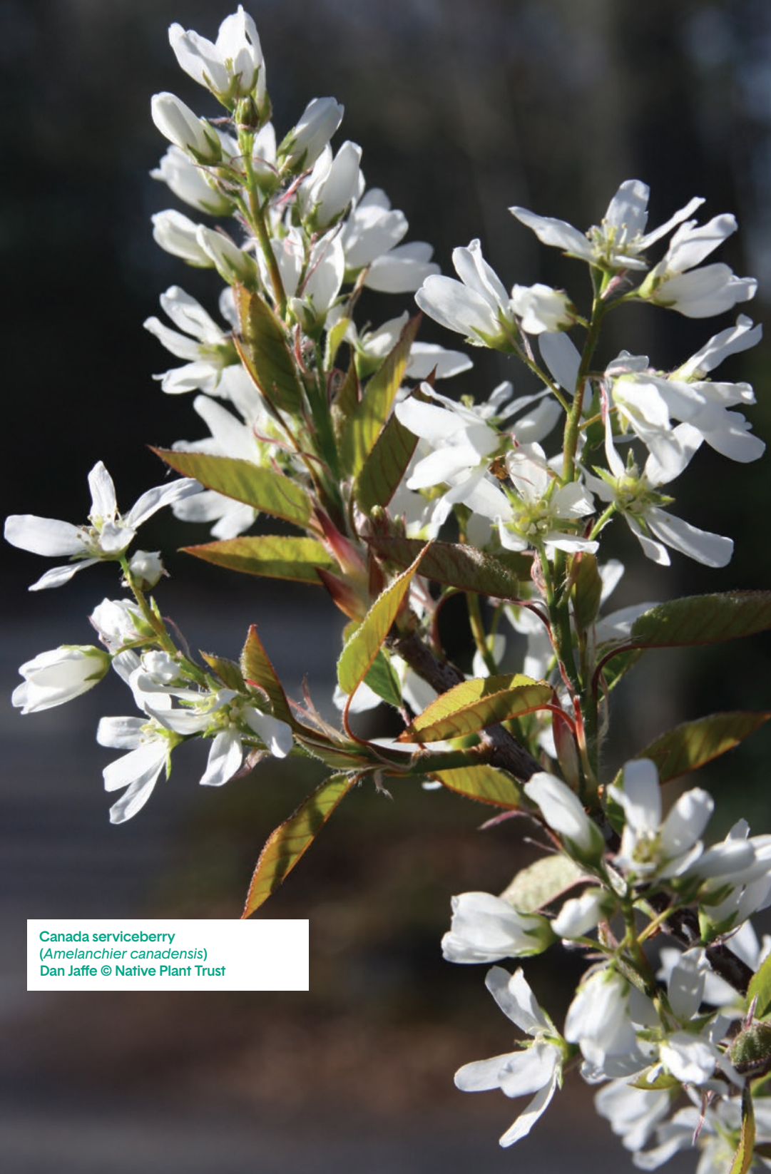
Canada serviceberry ( Amelanchier canadensis )