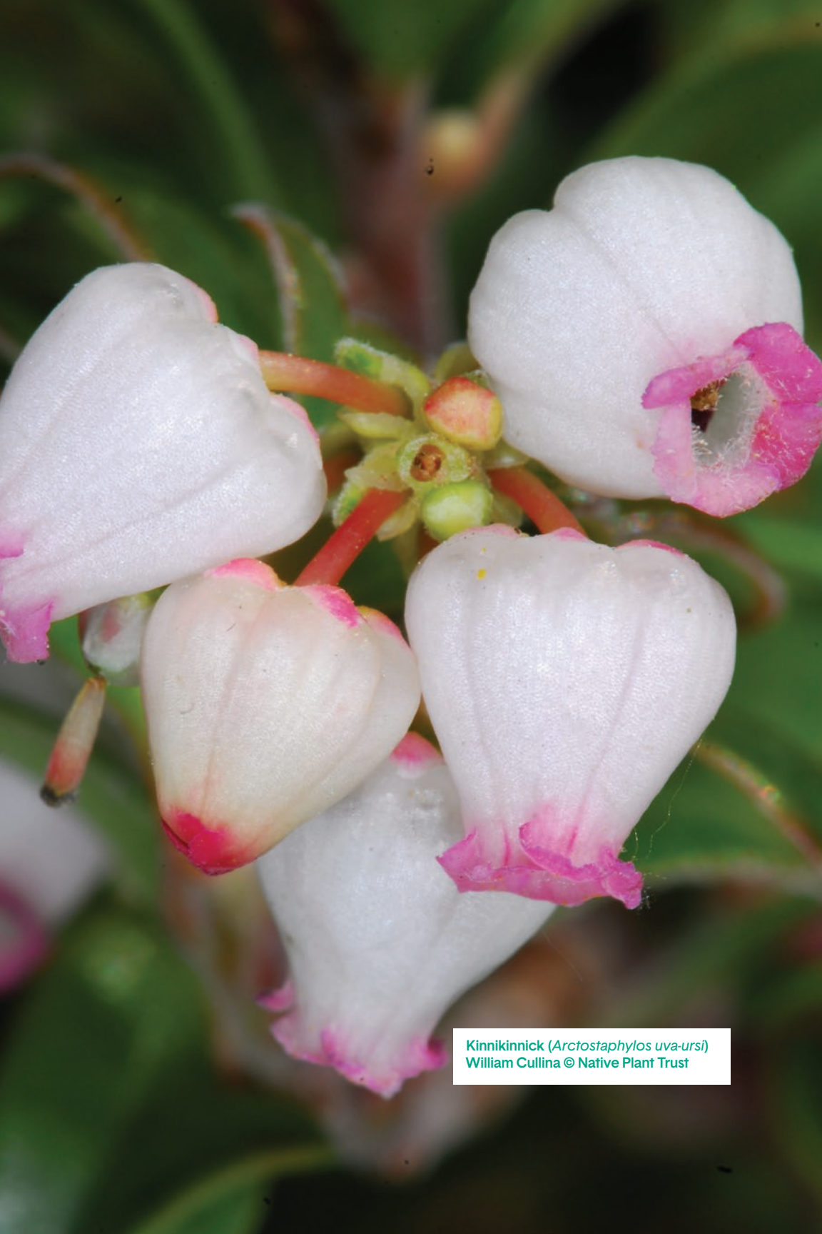
Kinnikinnick ( Arctostaphylos uva-ursi ) William Cullina © Native Plant Trust