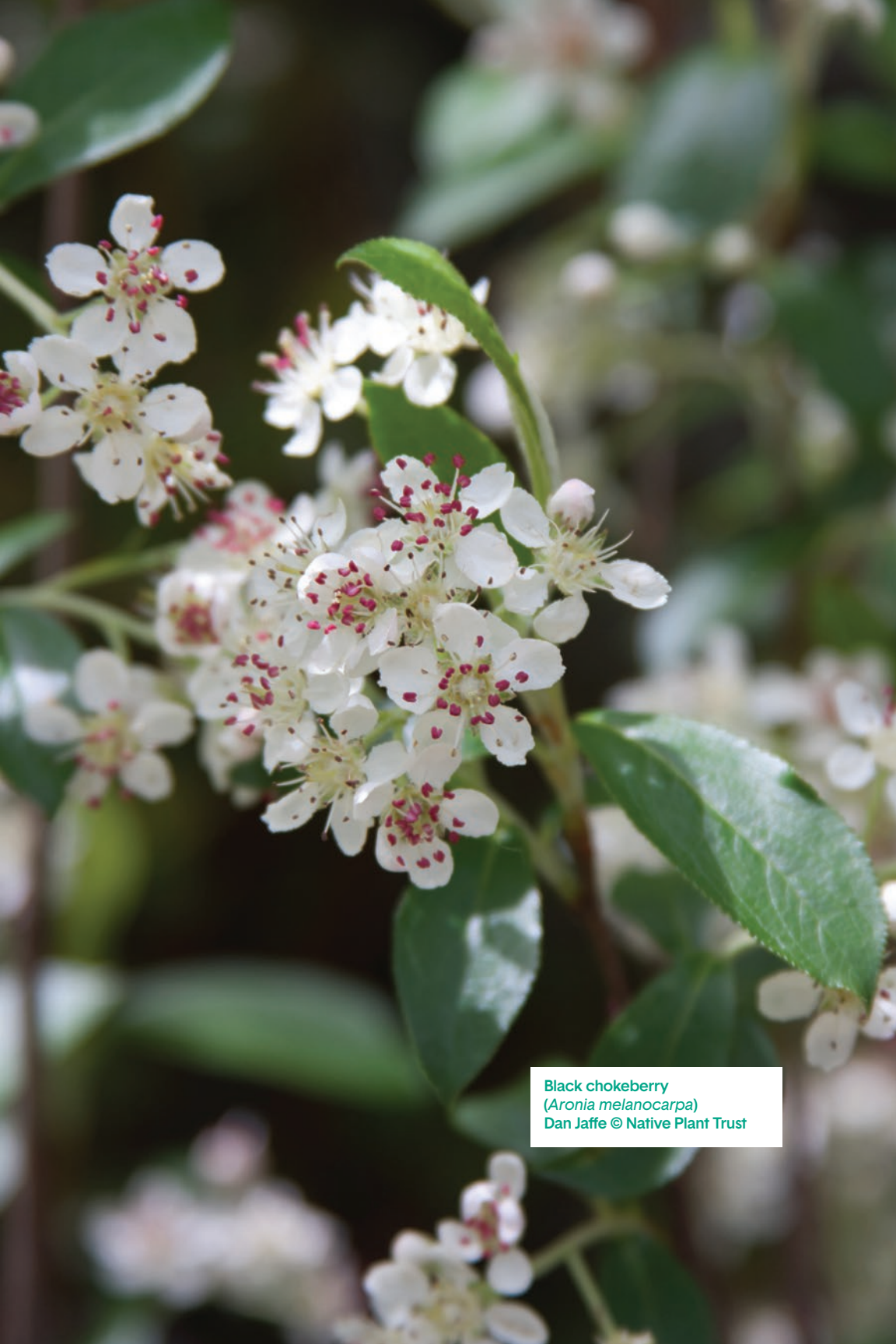
Black chokeberry ( Aronia melanocarpa )